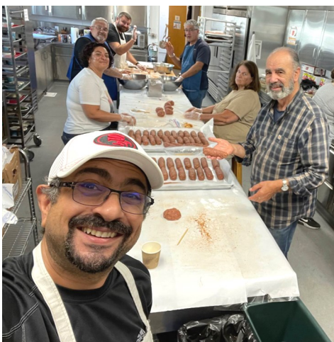
Volunteers met on September 27 to make 1,100 luleh kebabs for the Food Festival.

Հիսնակի պահոց շրջանին ֆիզիկապես և հոգեպես պատրաստվում ենք Քրիստոսի Սուրբ Ծննդյանն ու Աստվածհայտնությանը: Հիսնակի պահոց շրջանը իր լրումին է հասնում Սուրբ Ծննդյան ճրագալույցի Պատարագով և հունվարի 6-ին ջրօրհնյաց Պատարագով, նվիրված Քրիստոսի մկրտությանը Աստվածհայտնությանը: Կարինե Սուգիկյան