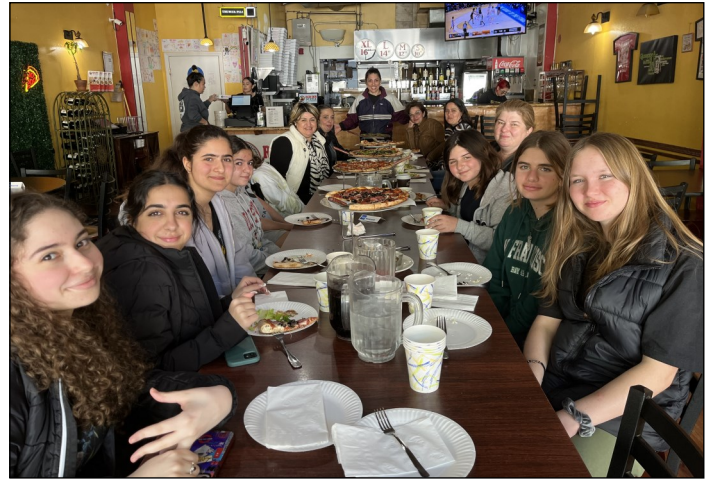
The St. Vartan Girls Volleyball team continues to prepare for Armenian Sports Weekend, May 26-28. On March 26 after practice the team gathered for a pizza lunch.