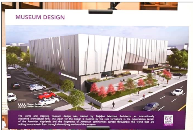
To the left is a rendering of the museum designed by Alajajian Marcoosi Architects, inspired by rock formations of the Armenian highlands and the fragments of the Armenian community throughout the world united into a solid form through the unifying mission of the museum.