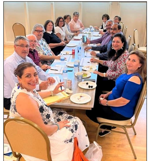
St. Vartan Church Food Festival Committee